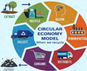
CIRCULAR ECONOMY MODEL When we recycle